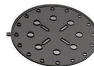
MATRIX Slope Correctors, sit under bottom pedestal, avoids all impacts from drain slopes.