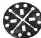
MATRIX DAMPER TB-A (40 Units Bags)