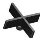
MATRIX Plus shape formed joint strips can be sit in the middle of pedestal and have 3mm thickness. Height 16mm.