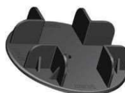
MATRIX X formed Carcass Assembly Equipment does sit on top and central of the pedestal.