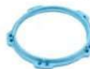
MATRIX FIX COLLAR TB-CR.