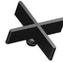
MATRIX Plus shape formed joint strips can be sit in the middle of pedestal and have 3mm thickness. Height 16mm.