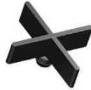
MATRIX Plus shape formed joint strips can be sit in the middle of pedestal and have 3mm thickness. Height 16mm.