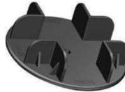
MATRIX X formed Carcass Assembly Equipment does sit on top and central of the pedestal.