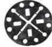
MATRIX DAMPER TB-A (40 Units Bags)